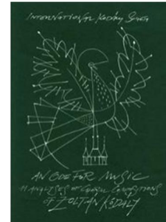
An Ode for Music